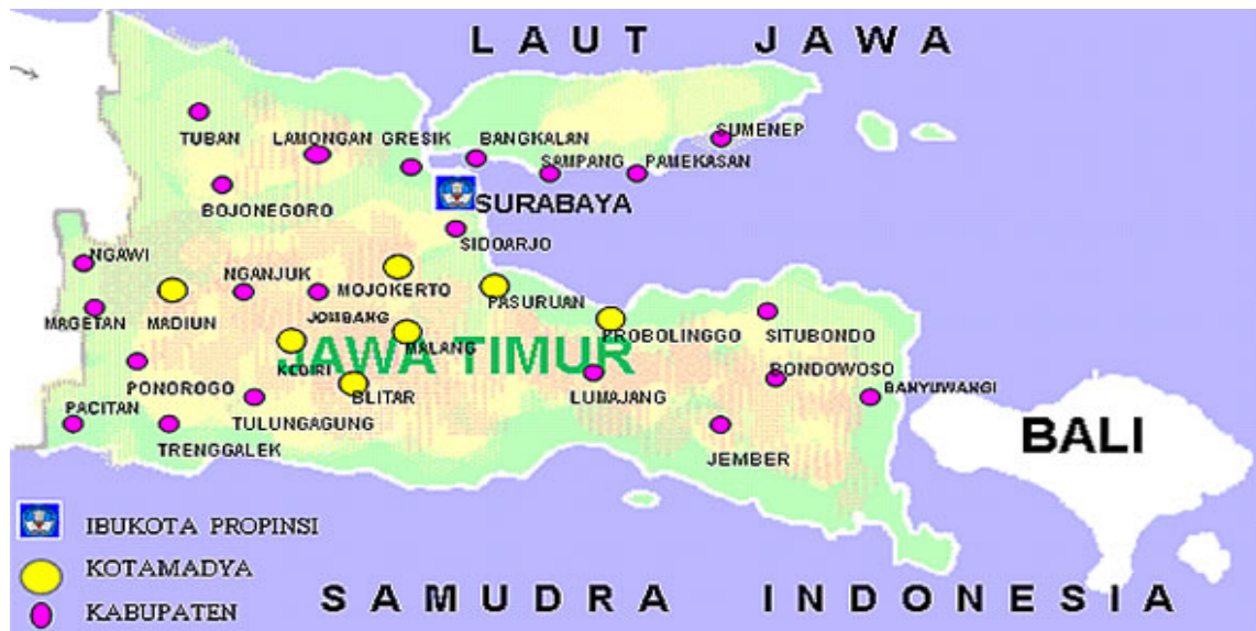
Figure 2. Research Location Map