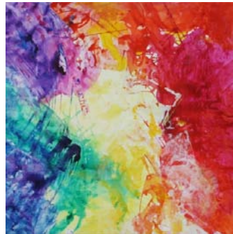
Image5) Light Phenomenon No.1/1-2014, Acrylic on canvas 185x185cm Painting depicts the light of a dawn of new day.

The creation from light phenomenon 10 set of paintings and mixed media consist of 23 paintings and 12 mixed media artworks as shown below.