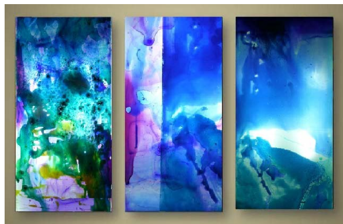
Image11) Artwork depicts light changes between seasons.

The Painting depicts light on a cloudy day.