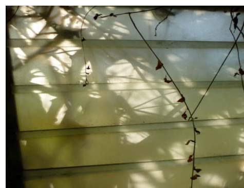
Image4) Example of comparison of artwork that are strike by natural light