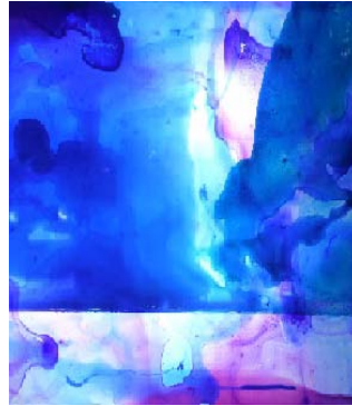
Image8) Light Phenomenon No.8/2-2014, Mixed media 60x80cm Artwork depicts the ray of light shining through clouds on a sunny day.