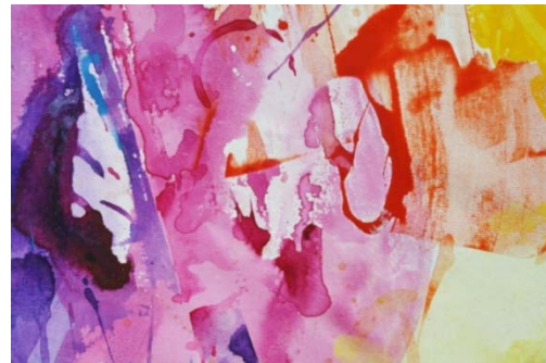
Image2) Method of painting on clear acrylic plate

Creative experimenting and comparing art works using Natural Light during 6.00-8.00am It's an hour of day that sunlight hits the working area every day that are sunny.