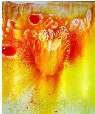
Image9) Light Phenomenon No.8/4-2014, Mixed media 60x80cm Artwork depicts bright light during the day.

Image8) Light Phenomenon No.8/2-2014, Mixed media 60x80cm Artwork depicts the ray of light shining through clouds on a sunny day.