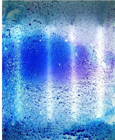
Image10) Light Phenomenon No.8/5-2014, Mixed media 60x80cm Artwork depicts light on a cloudy day.

The Painting depicts light on a cloudy day.