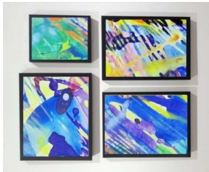
Image1) Method of painting on Canvas