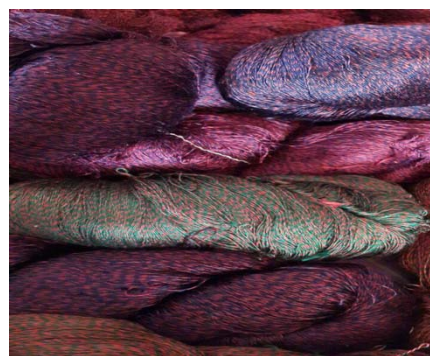
Figure 2 The Twist of Hang Karoak Thai Silk

Cited: Thai Silk Group, Ban Loongpradu, Huaytalang District, Nakhon Ratchasima Province