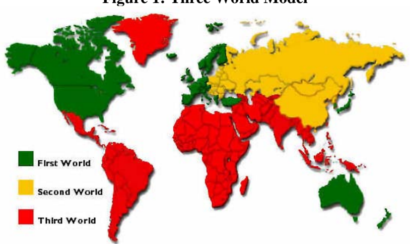
Figure 1: Three World Model