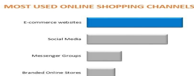
Figure 2. The Use of Media Online Purchase

Indonesian people are increasingly savvy in the use, development and utilisation of social media. For instance, they do not only use social media to connect with friends, but also to shop online. Although it is not limited to internet users in Indonesia, the use of social media for online shopping is still a unique opportunity, let alone see the development of a remarkable social media (Marketeers, 2015).