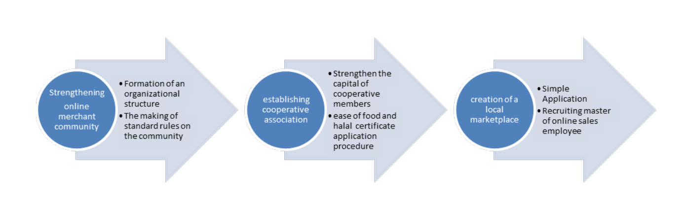
Figure 4.1 Stages of strengthening BTU's online market institutions