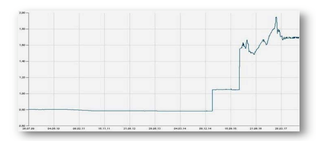
Pic.1 Exchange rate USD to AZN, from 2009 to 2017yy.

Monetary Fund (IMF) changed its ratings several times throughout 2017, either downwards or upwards. Thus, in April 2017, their forecast for the oil price was around $55 per barrel, in the summer of 2017, this mark was reduced to $52, and in January of 2018, was risen to $59.9 per barrel, while in April 2018, it was fixed at $62.3 per barrel. According to the OPEC reports, Saudi Arabia tends to the mark of 80-100 USD per barrel. However, many analysts, considering the possibility of increasing the price to $80, relate it to geopolitical influence. This conclusion was also reached by the author of this article, after taking into consideration the tense of USIranian relations, the threat of sanctions on the activities of the Islamic Republic of Iran, the ambiguous position of Venezuela, one of the major oil exporters, and the situation in the Middle East. [5] Considering such a position of the world important oil exporters and the forecasts of the well-known rating agencies, what kind of oil strategy can Azerbaijan lead and what risks can occur? These are the main questions that the author would like to raise in this article.