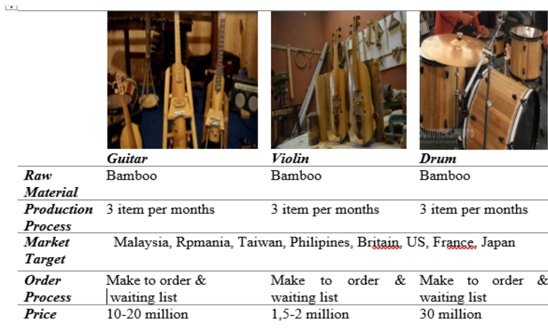
Table 4. Virage Awi Products

Three products are shown here because these three products are the mainstay of Virage Awi , which is unique to Indonesia and enjoys a large big market, especially by guitar enthusiasts worldwide.