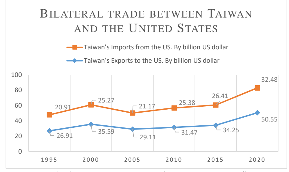
Figure 1. Bilateral trade between Taiwan and the United States.

also cultivates Taiwanese business leaders and aids in the integration of Taiwanese firms into global supply networks.