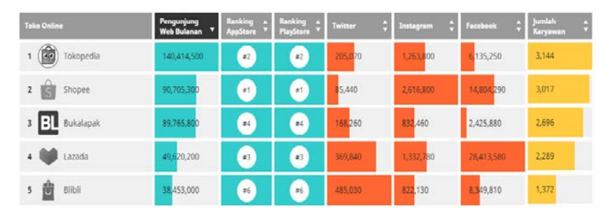
Figure 1.3 Most popular Mobile Shopping Apps

The large population, the rapid growth of internet and telephone users are potentials for the national digital economy. As a result, e-commerce, online transportation, online stores and other internet-based businesses have emerged in Indonesia. The internet continues to grow today, not only for information and communication media but the community makes it a tool to fulfill their needs, namely by buying and selling goods and services online and anyone is free to access all buying and selling activities.